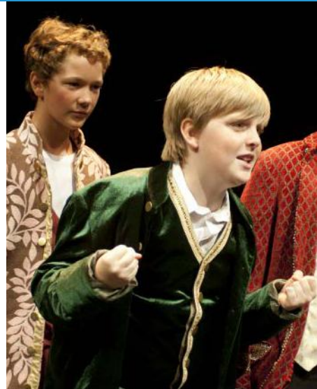
Recent productions include Peter Pan & Wendy , James and the Giant Peach , A Midsummer Night's Dream , The Secret Garden , Fantastic Mr Fox and more.

Faust International Youth Theatre performs additional plays and shows throughout the year. Faust members aged 8 and above will be invited to audition for these although no guarantee can be made that every member registered will perform.